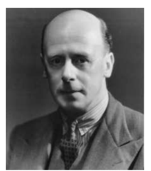
Cecil Roberts

He also described his walks from the cottage in the South Oxfordshire area in three books: 'Gone Rustic' (1934), 'Gone Rambling' (1835) and 'Gone Afield' (1935).