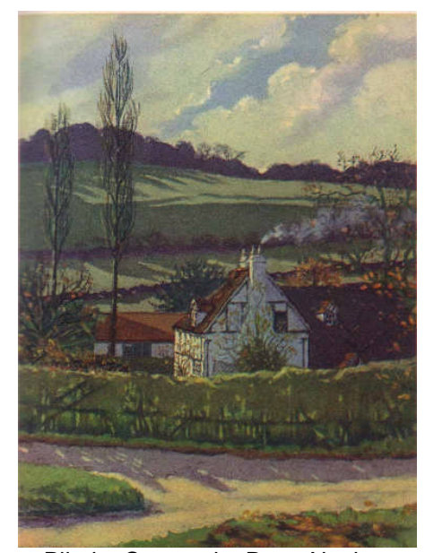
Pilgrim Cottage by Rene Noakes